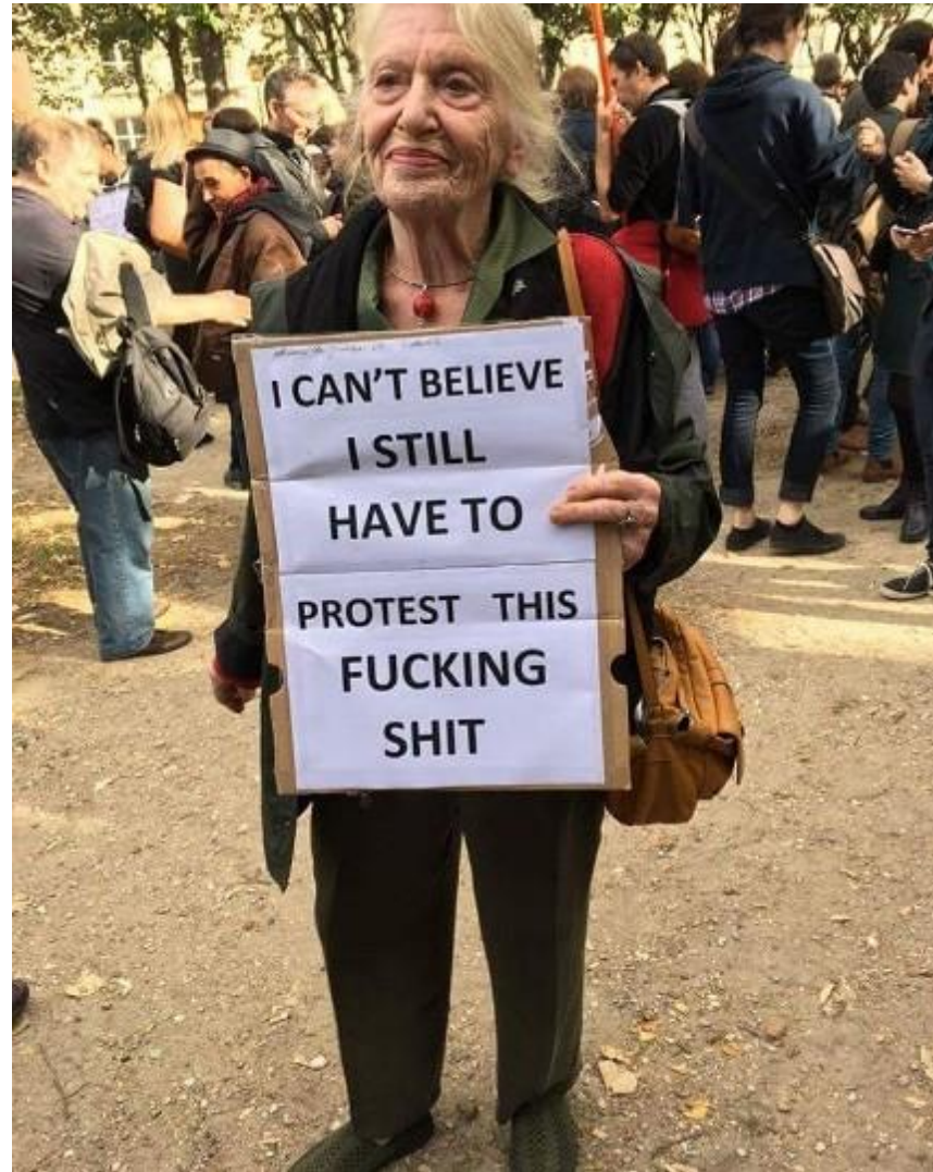
Protesting stricter abortion laws in Poland